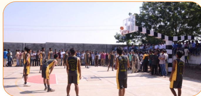
Basket Ball match in progress