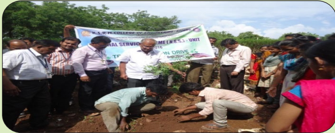
Saplings of plants by NSS volunteers

2. A road safety awareness program was conducted on N.S.S day i.e 24.09.2016. An essay writing competition on the theme “role of youth in nation building “ was also conducted and prizes were distributed to the winners of the competition.