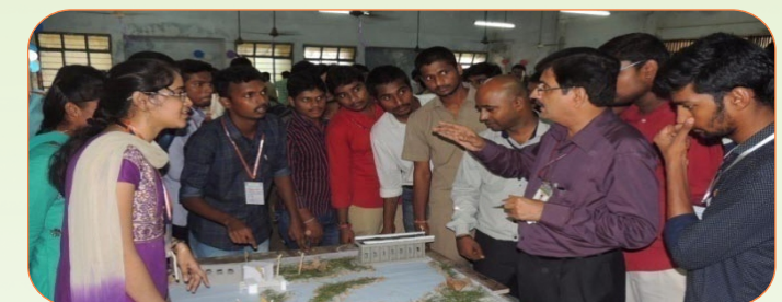
A project model execution

An initiation to extracurricular activities in the form of KSRM Students club took place with the help of all the students. Every Saturday, the club organizes events, activities and workshops for the integral development of the students.