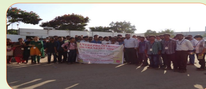
Industrial visit by students