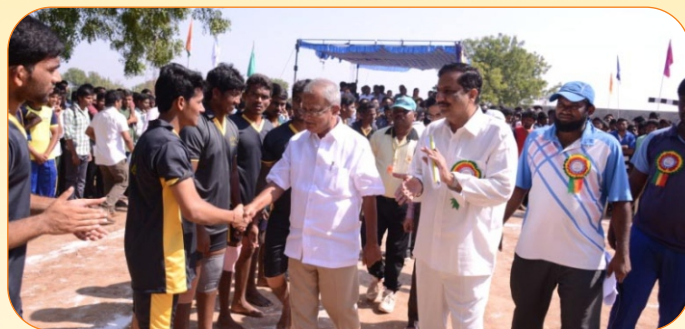
Introducing with kabaddi players