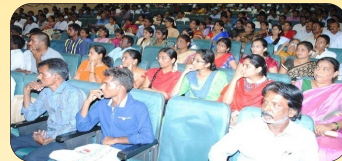
I B.Tech. Students & Parents in orientation programme