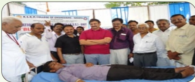
Students volunteers donating blood at blood donation camp at Nehru Park

A blood donation camp was organized along with Nehru park walkers association at Nehru park on 13.11.2016,in which 50 number of students voluntarily donated their blood. Sri. K.V.Satya Narayana, District Collector, inaugurated the blood donation camp.